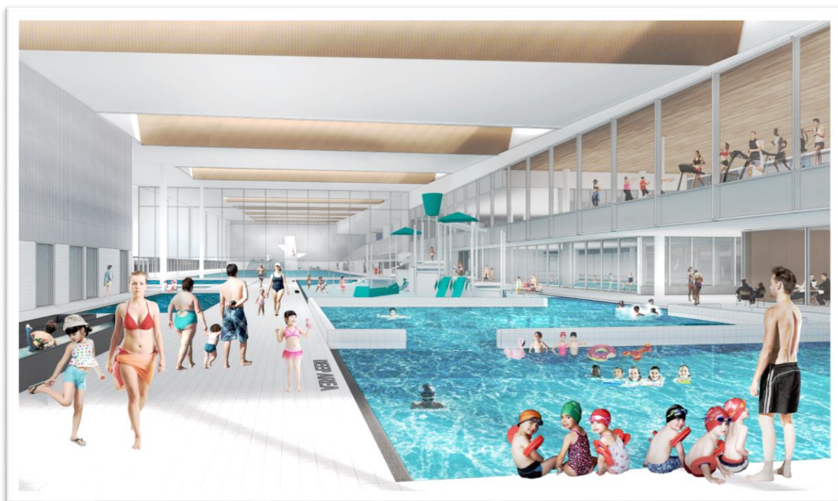
Artist impression: Leisure water area