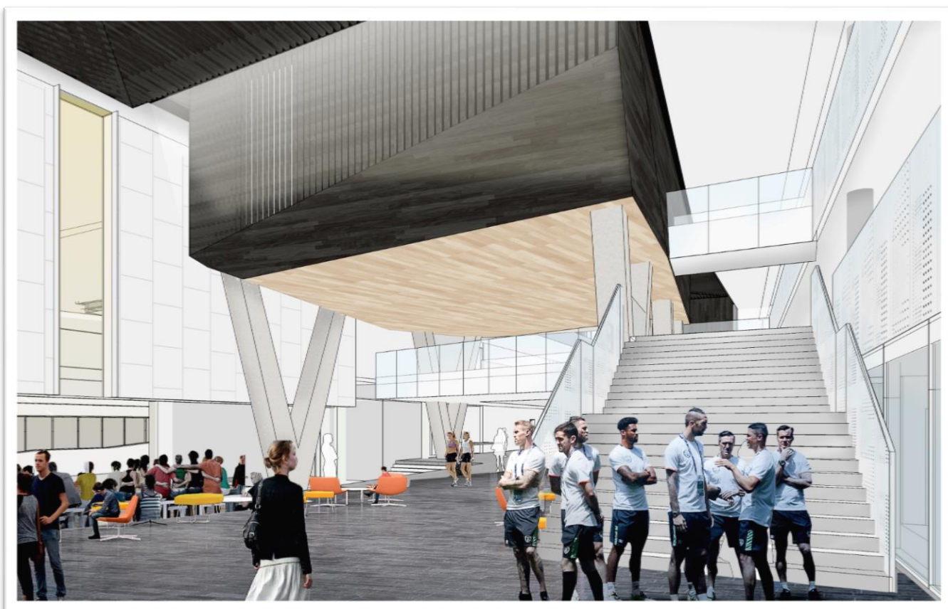
Artist impression: Entry area

Ōtākaro Limited has selected Leighs Cockram Joint Venture Ltd. to proceed as the single ECI (Early Contractor Involvement) contractor for the next design stage of the Metro Sports Facility. The ECI process brought two contractors into the design process in April 2016 so the design team could incorporate their knowledge of construction methods, cost management and health and safety into the project. Ōtākaro has selected Leighs Cockram Joint Venture who have demonstrated strong specialist knowledge of the project and are confident in their ability to make technical, construction and design improvements throughout their involvement. Subject to their continued performance and commercial negotiations, Leighs Cockram Joint Venture may then have the opportunity to stay on and be involved in the build itself when the main construction contractor is selected around June 2017.