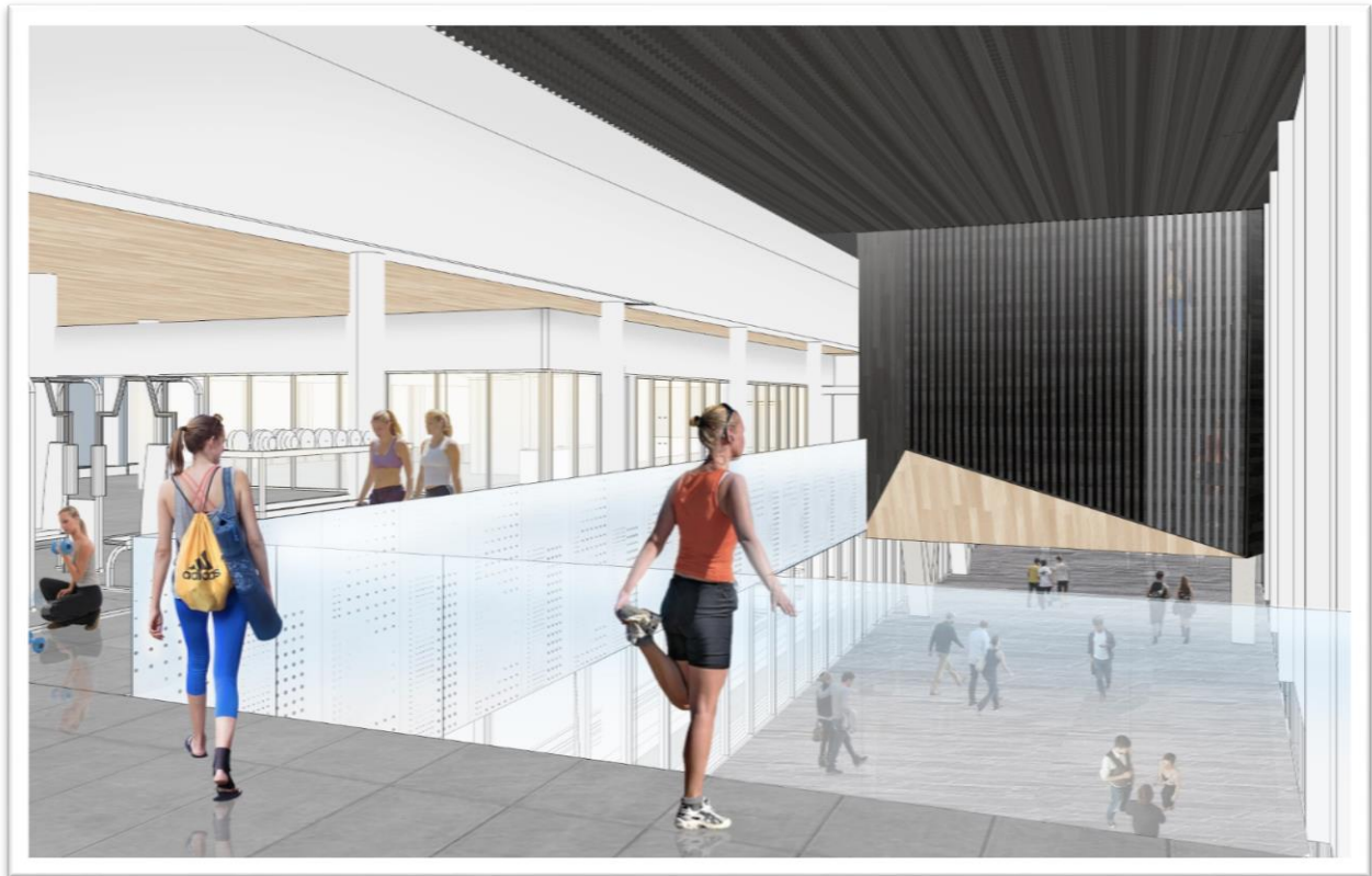
Artist impression: First floor