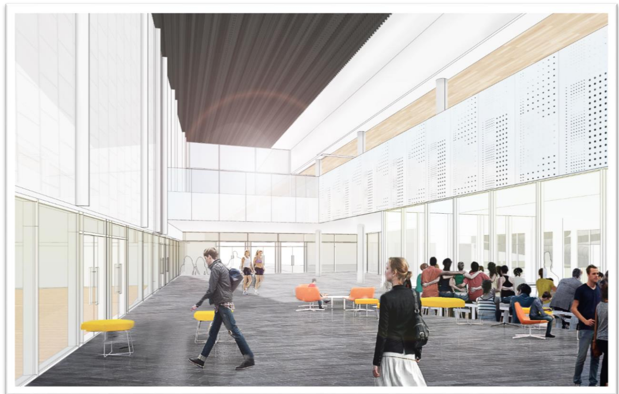
Artist impression: Entry area