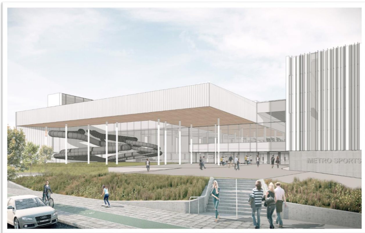
Artist impression: Northern entry